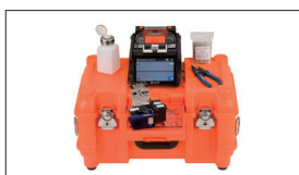
Carrying case with worktable CC-82