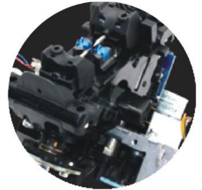
Integrated fiber-adjust frame

Built -in Japanese components and Korean chipset