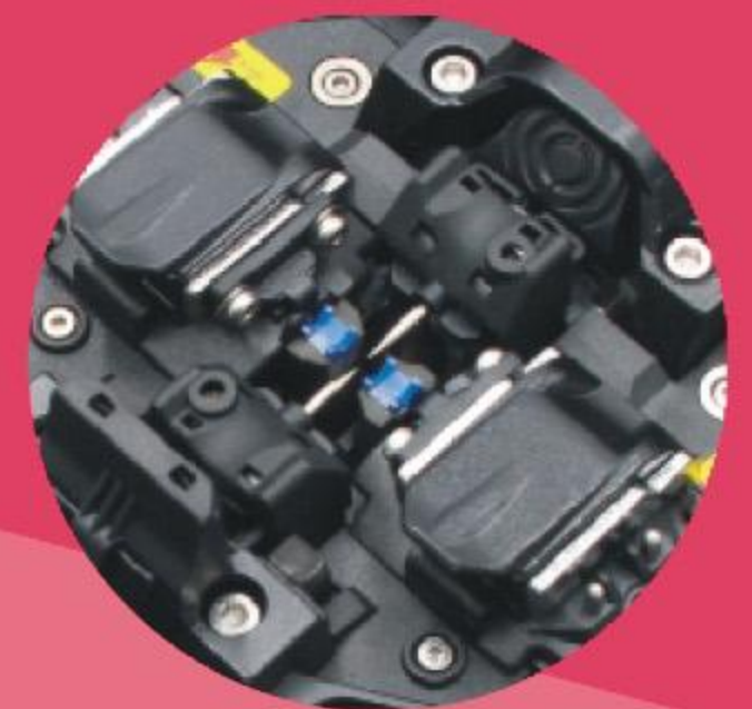
Detachable multifunction fixture