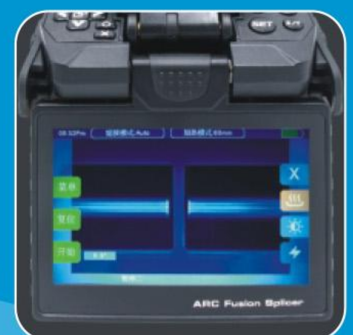
5" touch screen