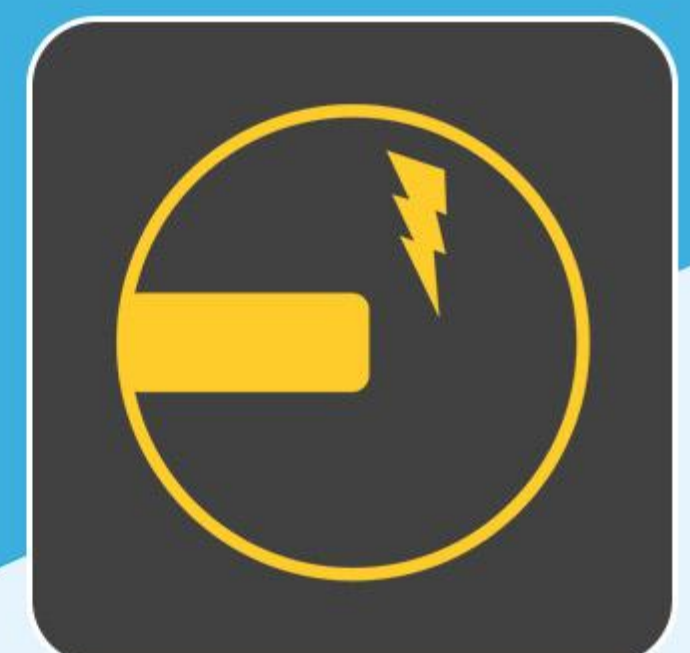
Fiber endface melter & fusion splicer 2 in 1