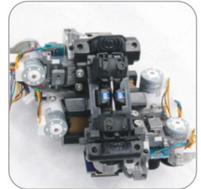
Integrated fiber-adjust frame

Optical imaging system ranks No. 1 in the world